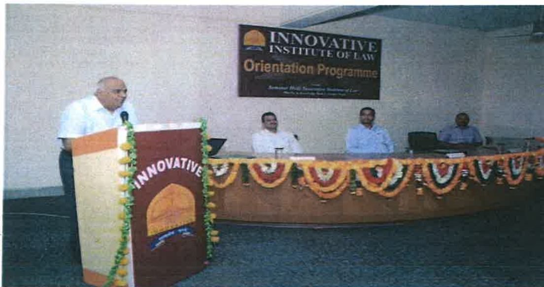
FOSTERING A COLLABORATIVE LEARNING ENVIRONMENT

Approved by Bar Council of India (BCI), Delhi & Affiliated To CCS University, Meerut, U. P.