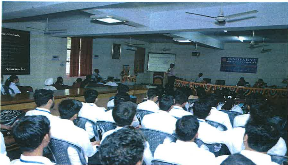
Sessions that allow students to explore scenarios related to the Code of Conduct,

PRINCIPAL Innovative Institute of Law Plot No -6 Knowledge Park-2 Greater Noida-201308