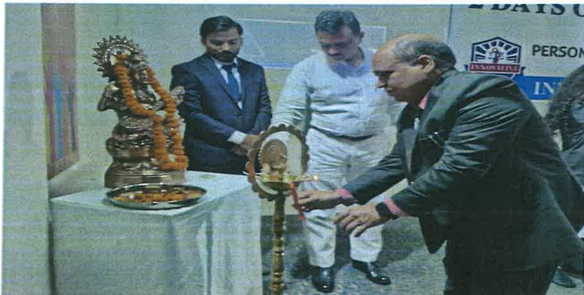
LAMP LIGHTNING IN CODE OF CONDUCT PROGRAM

PRINCIPAL, Innovative Institute of Law Plot No -6 Knowledge Park-2 Greater Noida-201308