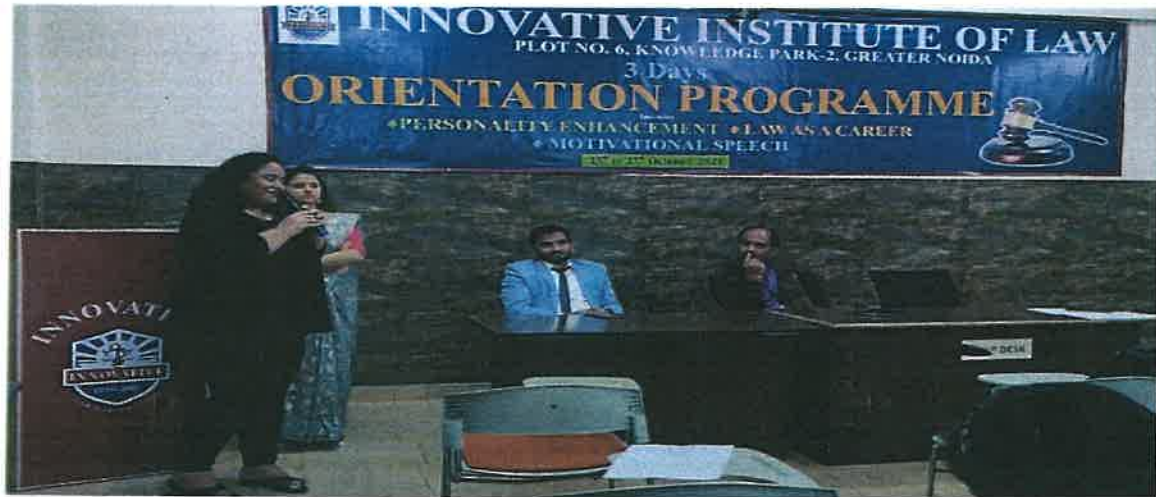
Celebration of the Code of Conduct in Innovative Institute of Law

Approved by Bar Council of India (BCI), Delhi & Affiliated To CCS University, Meerut, U. P.