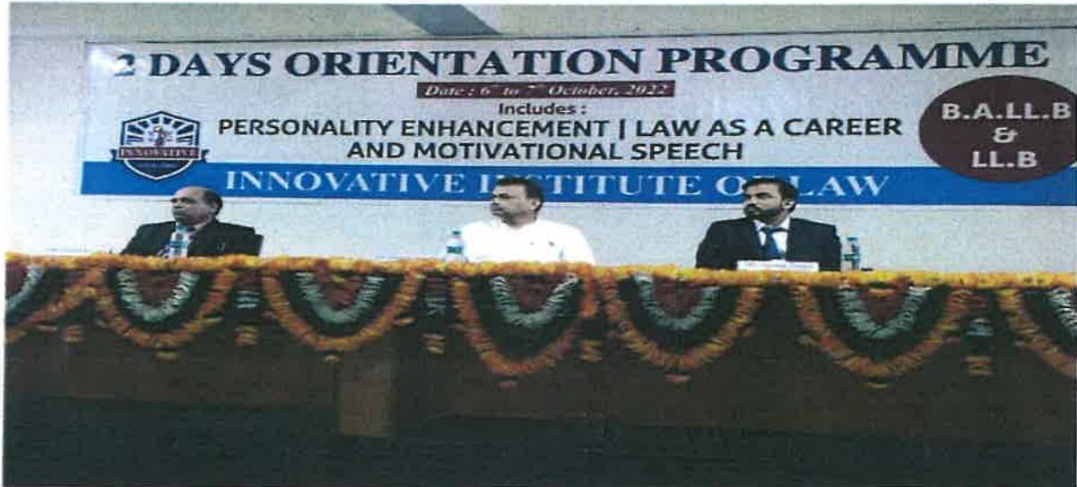
Code of Conduct at the Orientation Session of the Innovative Institute of Law

Approved by Bar Council of India (BCI), Delhi & Affiliated To CCS University, Meerut, U. P.