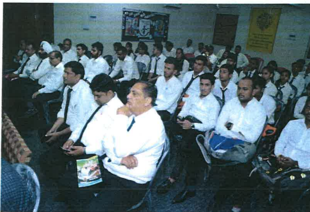
STUDENTS ACTIVE PARTICIPATION IN CODE OF CONDUCT